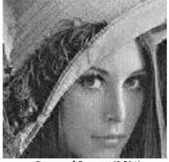
Cropped Image (25%)