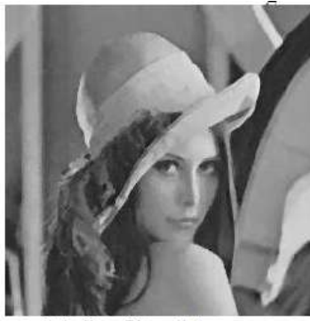
Median filtered Image