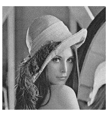
\begin{array}{c} \mbox{Reconstructed watermarked} \\ \mbox{Image } (I_w) \\ \mbox{Figure 3.} \end{array}