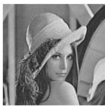
Jpeg compressed image