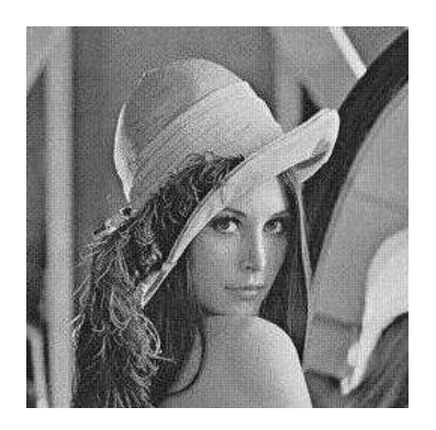
Original Image (I<sub>0</sub>)