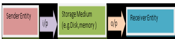
Figure 1: Example Storage Channels

Covert storage channels are strategies of communication that “include all vehicles that might permit the direct or indirect writing of a storage location by one method and also the direct or indirect reading of it by another [2].In alternative words, one method writes to a shared resource, whereas another method reads from it. Storage channels are often used between processes among one pc or between multiple computers across a network [3]. A decent example of a storage channel could be a printing queue. The method with higher security privileges, the causing method, either fills up the printer queue to signal a one or leaves it because it is to signal a zero. The method with lower security privileges, the receiving method, polls the printer queue to envision whether or not or not it's full and deter-mines the worth consequently.